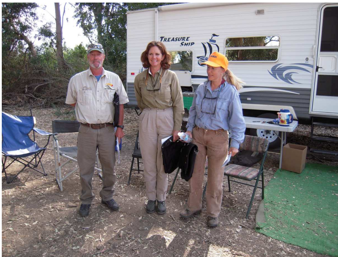
The Judges of the So. Cal NAVHDA Fall Test.